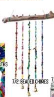
7/2. BEADED CHIMES