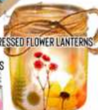
7/23. PRESSED FLOWER LANTERNS