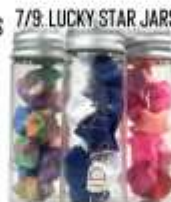
7/9. LUCKY STAR JARS