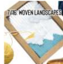
7/16. WOVEN LANDSCAPES