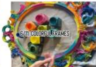
6/11. COLORFUL FRAMES