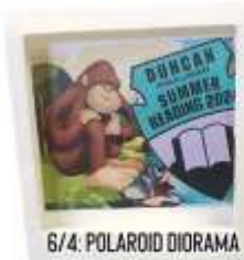
6/4. POLAROID DIORAMA

Teen crafts are Tuesdays at 11 am or 1 pm in the annex. Sign up starting the Monday before! Only 15 spots available for each craft hour. For other events teen can participate in, check out the insert and calendar!