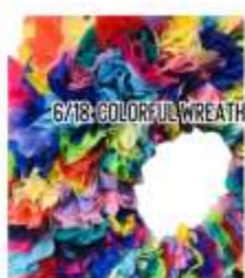
6/18. COLORFUL WREATHS